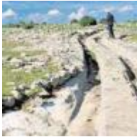
From Requena to Ayora [19]