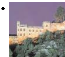
From Buñol to Xàtiva [16]