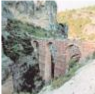
From Castielfabib to Lliria [21]