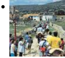
From Culla to Benicarló [5]