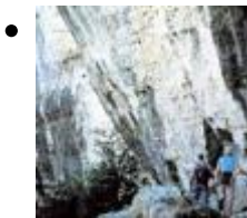
Through landscapes of stone, farmsteads and holm oaks [7]