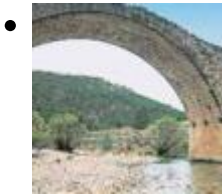
From Vistabella del Maestrazgo to Vila-real [13]