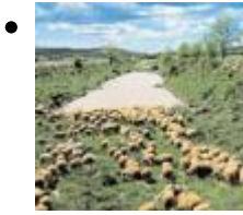
From Barracas to Sagunto [10]