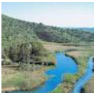
From Villena to Oliva [23]