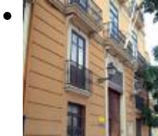
The José Benlliure Home Museum [10]