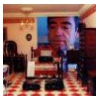
The Antonio Marco Museum (Nativity Scene Museum) [1]