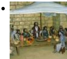
Belenes museum [11]