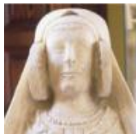
Municipal arqueological, ethnological and paleontological museum [3]