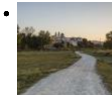
Turia River Natural Park [1]