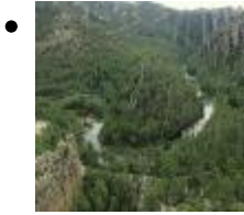
Hoces del Cabriel Natural Park [4]