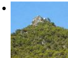
Carrascar de la Font Roja [1]