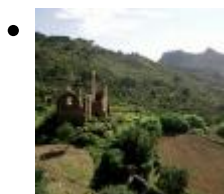
Desert de les Palmes Nature Park [3]