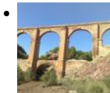
The Algezares de Aspe [1]