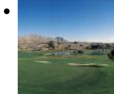
Alenda Golf [1]